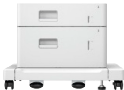
HIGH CAPACITY CASSETTE FEEDING UNIT-D1