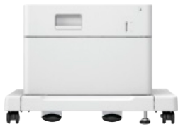
CASSETTE FEEDING UNIT-AR1