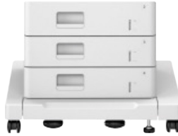
CASSETTE FEEDING UNIT-AX1