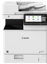
imageFORCE 710F* (Non-Finisher Model)