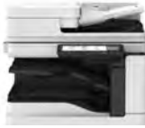
Inner 2Way Tray-M1